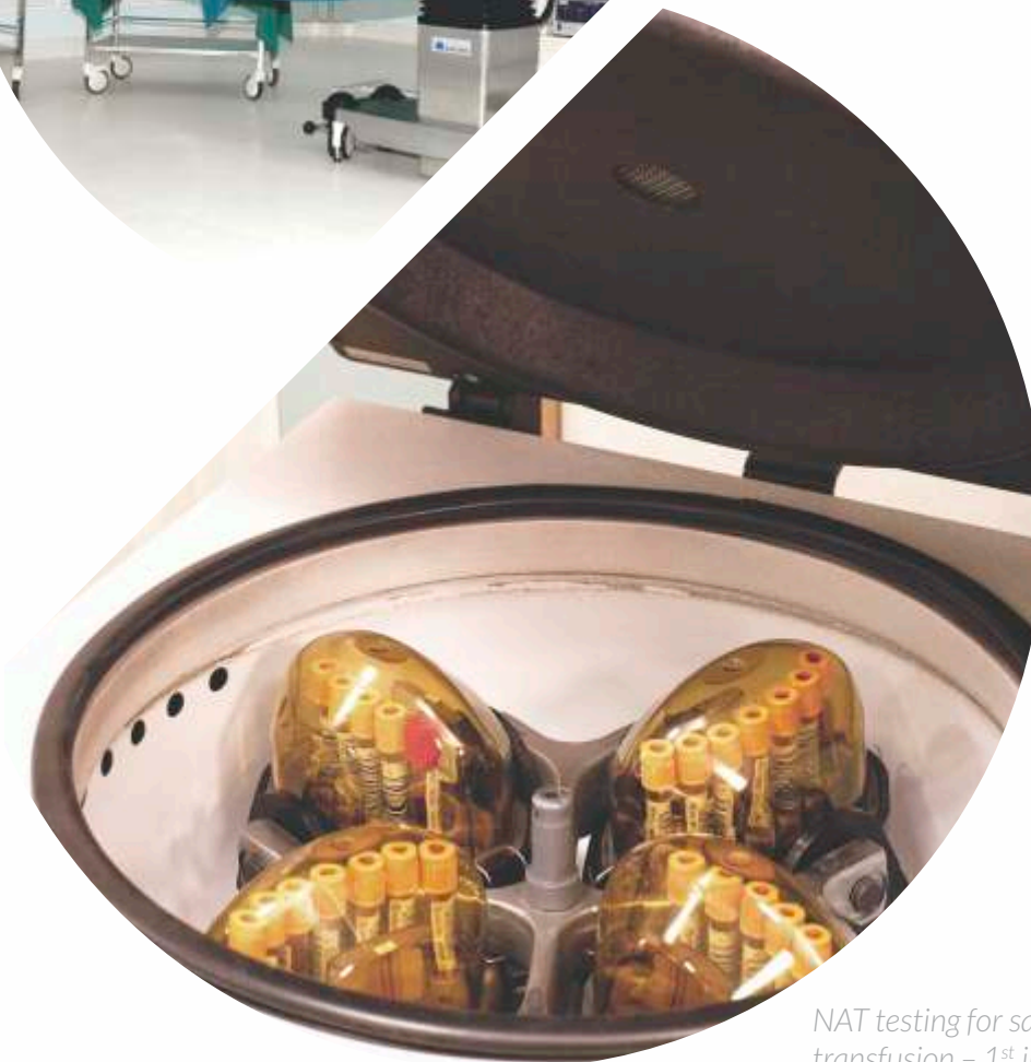
NAT testing for safe blood transfusion – 1 st in Mumbai