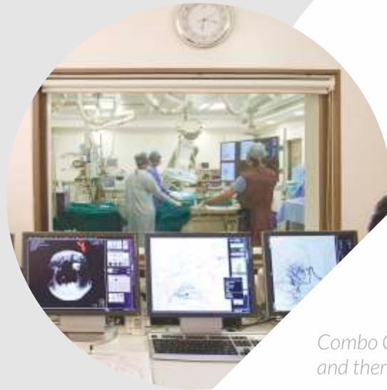
Combo Cath Lab for simultaneous diagnosis and therapeutic cardiac treatments

The hospital has been at the forefront of adopting new technology. From being the first hospital in Southeast Asia to acquire the Gamma Knife to the latest MRI with ambient theme, the hospital has always been bringing in newer technology to provide the best care.