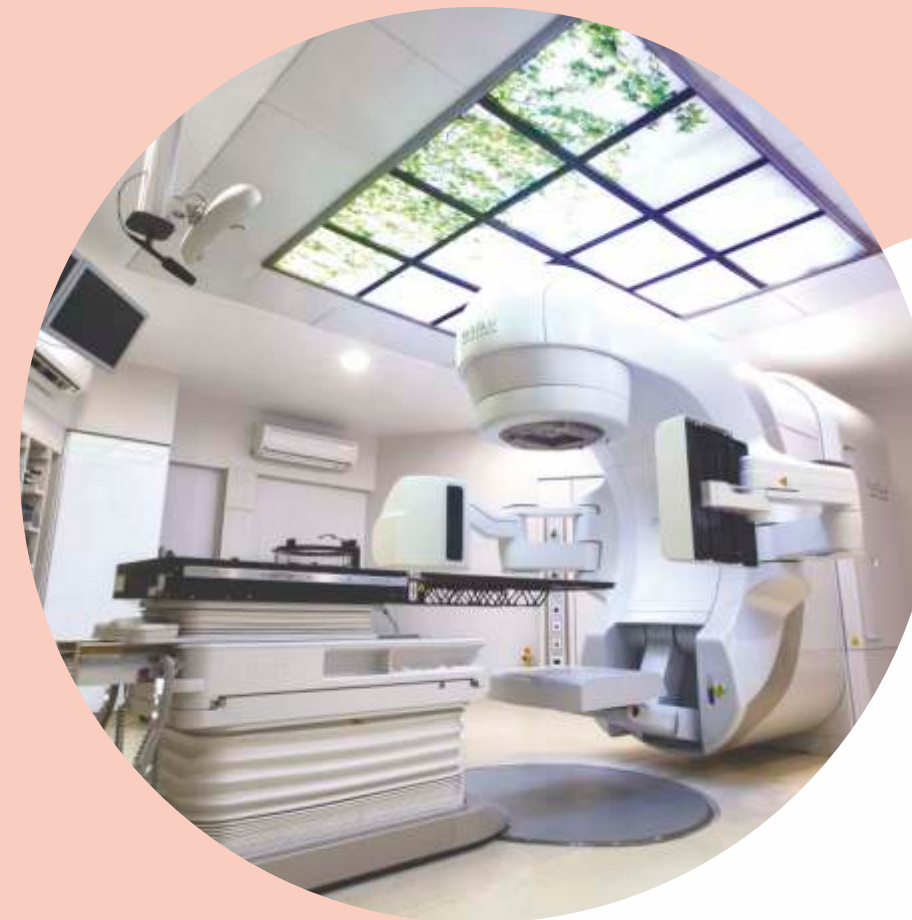
Advanced Linear Accelerator with prone breast radiation therapy