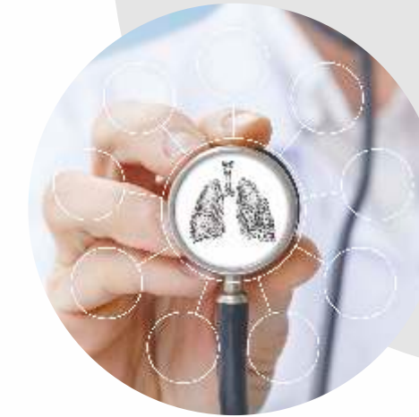
Collagen Lung Clinic