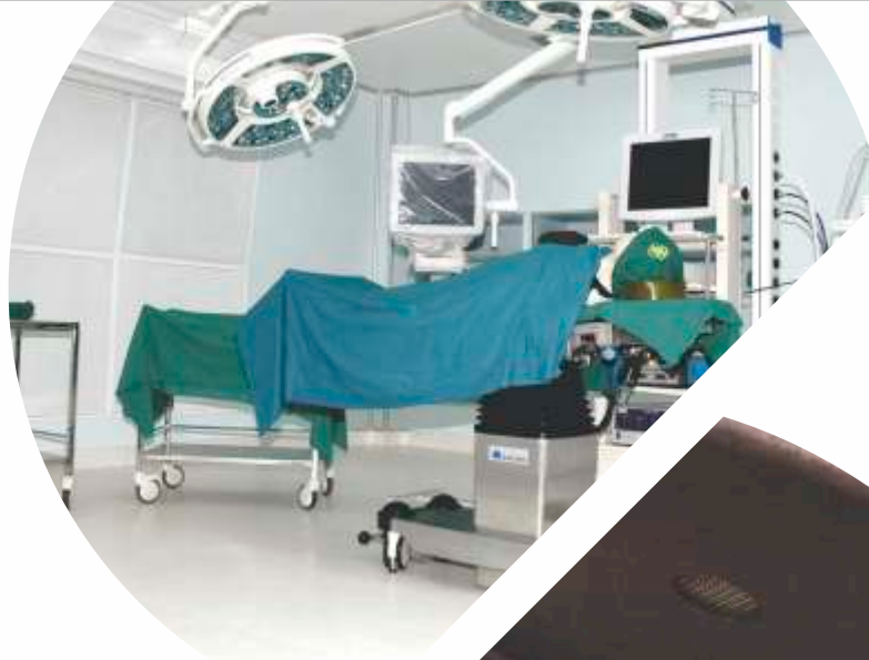
State-of-the-art Guided Air Flow OT, Green OT certified