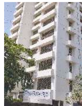
OPD Building, Khar