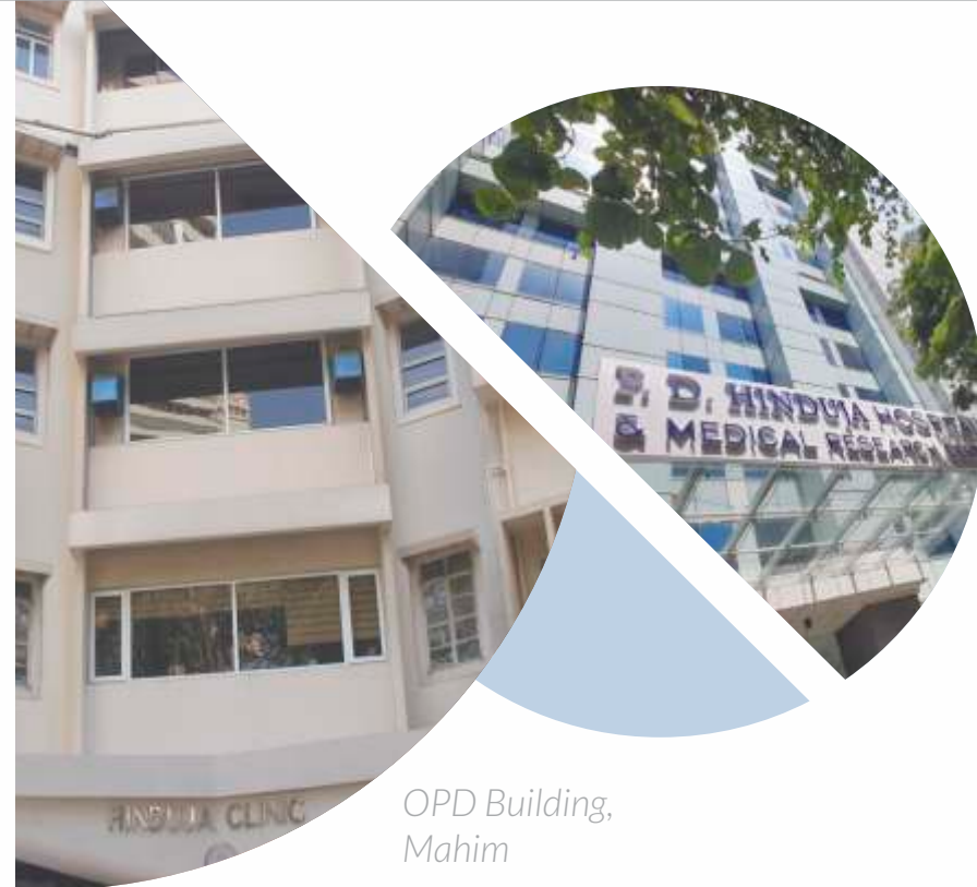
OPD Building, Mahim