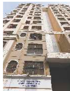
College of Nursing, Andheri