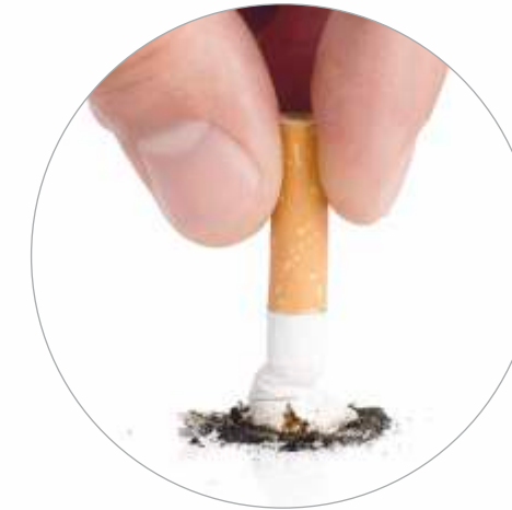
Tobacco Cessation Clinic