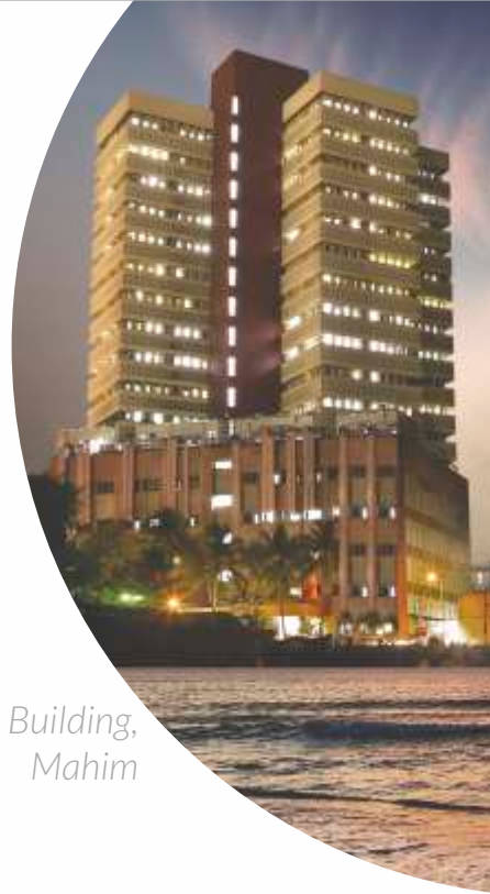
IPD Building, Mahim