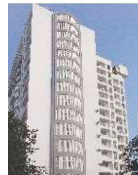
Lalita Girdhar Tower 1, Mahim