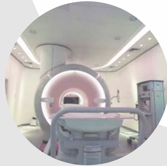
First ever digital broadband MRI system with ambient themes