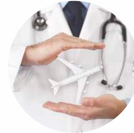
Travel Medicine Clinic