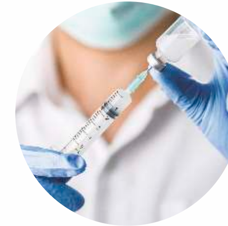
Adult Immunisation Clinic