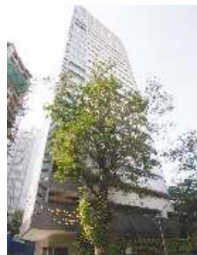
Lalita Girdhar Tower 2, Mahim