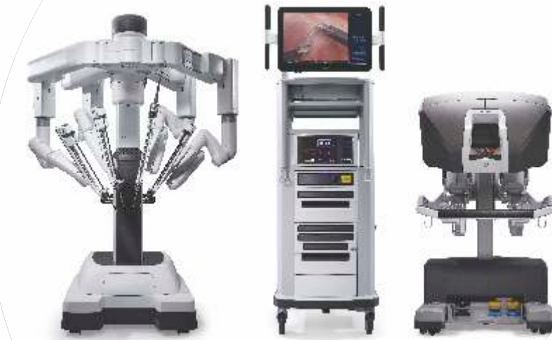
DaVinci Xi Robotic System – World's most advanced integrated robotic system